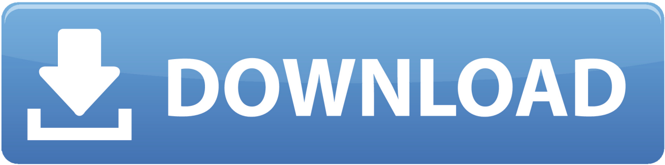
Graphic Equalizer Studio V2.5 VST (PC).rar